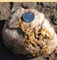
Mitchel - California