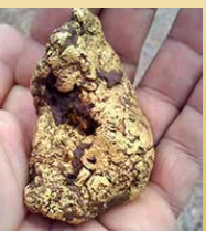
SJ - Brazil