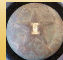
Rocky - Virginia