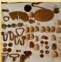
Van - USA