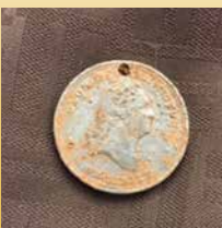
Gary - Massachusetts