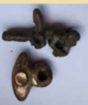
Wilb - Peru